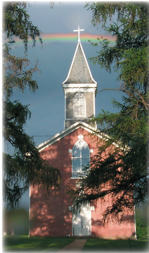
St. Marys Church Mattingly Settlement